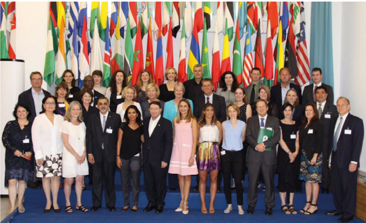
Conference to end the sexual exploitation of children in the travel and tourism industry, Madrid