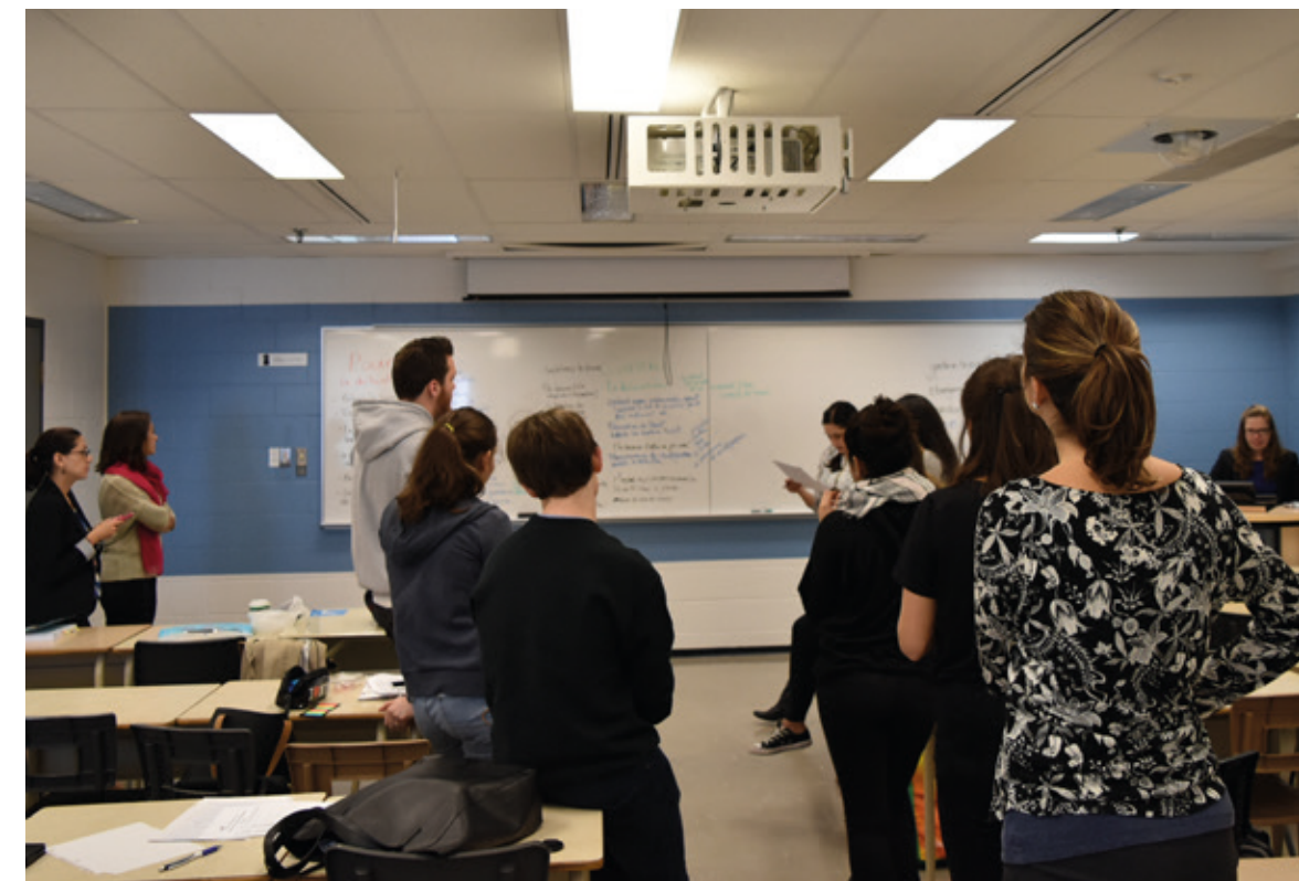
IBCR summer school on the international and comparative protection of children's rights – UQAM

The students were very committed, interacting with our professionals and working on case studies that focused on the judicial, security and social sectors tasked with protecting children.