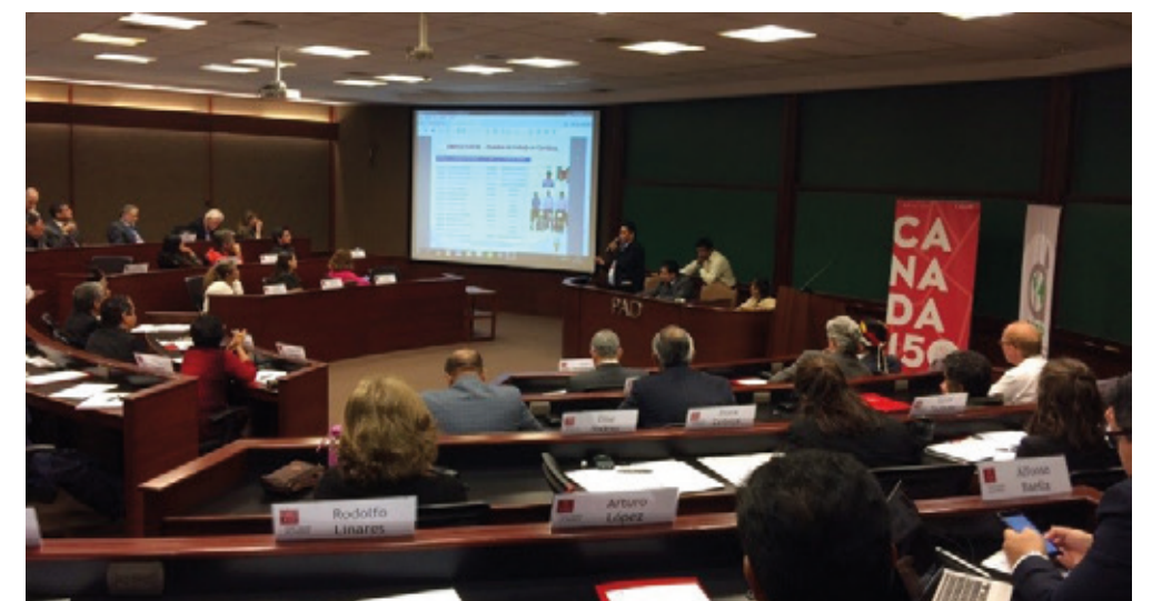
4 th Macro-Regional Meeting of the South - Lima