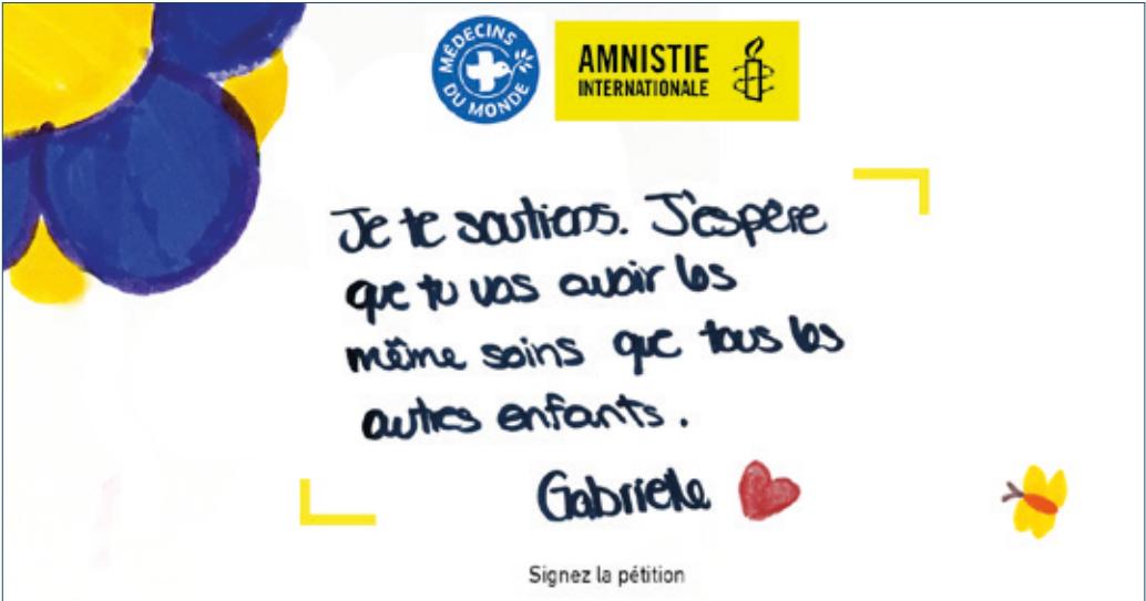
Communication material for the Doctors of the World/ Amnesty International joint petition

“A child’s right to healthcare is part of the UN’s International Covenant on Economic, Social and Cultural Rights and the Convention on the Rights of the Child, to which both Canada and Quebec are bound. Yet, thousands of Canadian children are victims of discrimination because their right to healthcare in Quebec depends on their parents’ immigration status. For a child born in Canada to immigrant parents, his or her eligibility for Quebec’s health plan, the Régime d’assurance maladie du Québec (RAMQ), should not depend on the precarious immigration status of his or her parents. But the RAMQ requests proof of immigration status, otherwise these children are ineligible until they reach the age of 18. This deprives young Canadians of the healthcare they need and increases their family’s vulnerability by making them responsible for defraying inordinate costs.”