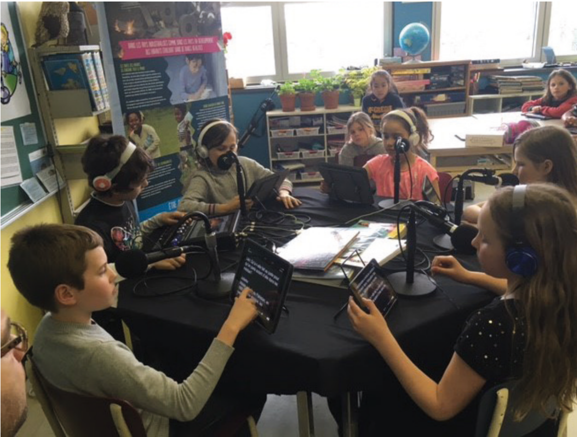
Saint-Fabien School radio show

Their dynamic enthusiasm was a real source of inspiration for the IBCR, as we strive to make child participation a guiding principle of our programmes.