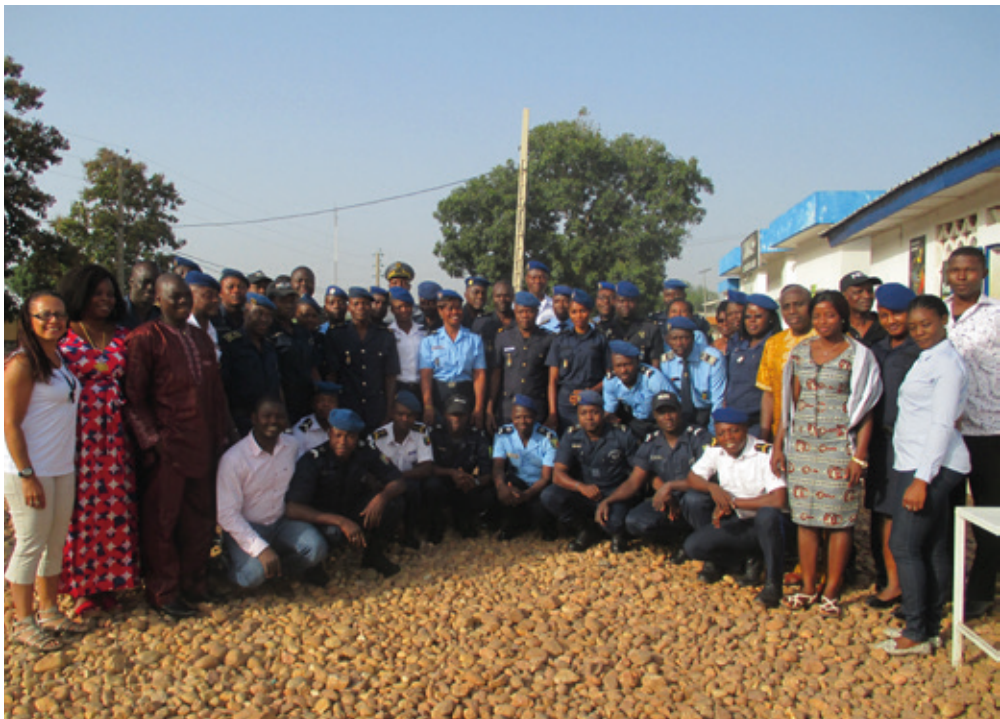
Training of key staff, Security services – Kandy

Today, Benin has a strengthened legal and institutional arsenal to better protect vulnerable children, those who are victims of abuse, violence or exploitation, and those who are in conflict with the law. However, despite the establishment of this framework, very few children have real access to social and judicial protection and rehabilitation services. To offer more effective and adapted child protection services, the Beninese Government wished to strengthen and expand the services of its Juvenile Protection Central Office to several regions in the country. Capacity building of its social workers with respect to child protection procedures and mechanisms was also part of the many actions to be undertaken. Thanks to financial support from UNICEF Benin, the IBCR has been supporting and guiding the Government of Benin to achieve its commitments since 2014.