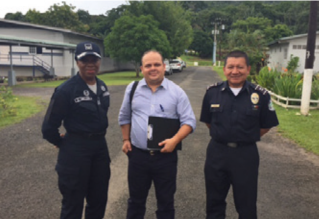
Trip to exchange practices between police authorities in Costa Rica and Panama

Because human trafficking is a national and transnational crime, discussing good practices and challenges as well as sharing knowledge between neighbouring countries can be very beneficial. The IBCR took advantage of its increased regional presence to share professional experiences with bordering countries through exchange trips (Colombia and Panama), human trafficking seminars and participation in the establishment of the Latin American Knowledge Management Centre.