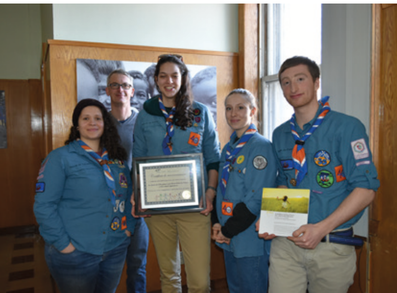
Young scouts visiting IBCR offices

fered us the first prize. Representatives from the scout group visited the IBCR offices to personally give us a $500 cheque. It was a great opportunity to talk about both the IBCR and the Scouts' mission, activities and values. THANK YOU to these youngsters for their donation and commitment to children's rights!