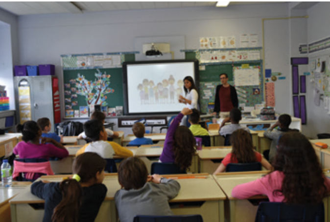
IBCR presentation in an elementary class, La Vérendrye School

put their newly-acquired knowledge into practice by participating in an activity during which teams had to identify which rights had not been respected in short stories that were shown to them. This event helped students learn more about their rights and gave them an opportunity to ask questions.