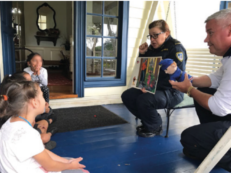
Police-led awareness workshops for safety in the community and at school, for children at Casa de Pan

As part of a training for instructors on children’s rights and human trafficking, the IBCR worked with police officers participating in the project in the Casa de Pan group home, which fosters some 40 children. Police officers were made aware of the various issues affecting children, before discussing with them through different playful workshops. For the younger children, police officers chose to talk about safety in the community and at school through illustrated stories and a puppet. For children aged 6 to 12, a sports station was set up to foster positive discussions. Finally, project participants led a youth workshop to increase their awareness of social media safety.