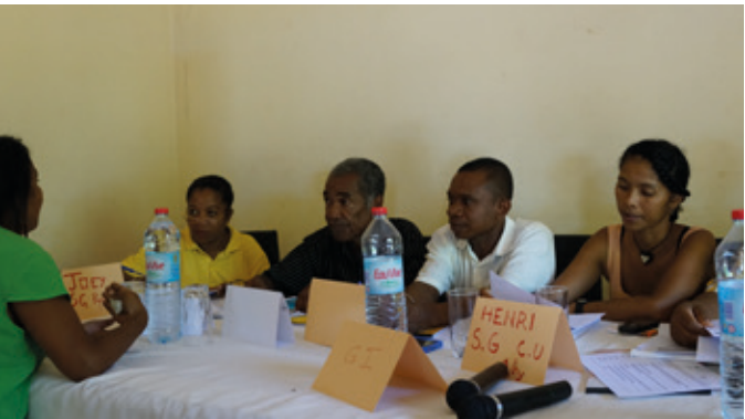
Data gathering workshop - Antshohihy

“Hitting children isn't right, choosing your words carefully when speaking to children is important, and showing kindness is fundamental.”