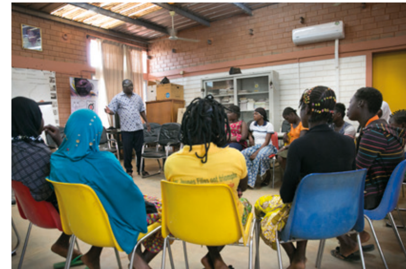
Theatre workshop – Kinshasa (left) and Ouagadougou (right)