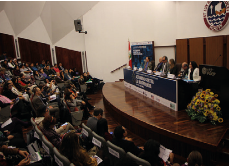
5 th Latin American conference on human trafficking, Lima

It is estimated that human trafficking generates billions of dollars a year worldwide, making it one of the most lucrative international criminal activities. As part of its partnership with the Peruvian organisation CHS Alternativo, the IBCR participated in the 5 th Latin American conference on human trafficking held in Lima. Three members of the IBCR's board, including the president of CHS Alternativo and our volunteer legal advisor, worked with government, university and civil society partners to develop strategies and public policies to combat human trafficking. The event was an invaluable opportunity to increase and share knowledge about human trafficking in Latin America and the Caribbean, in order to improve state, civil and personal initiatives in the fight against this serious violation of human rights.