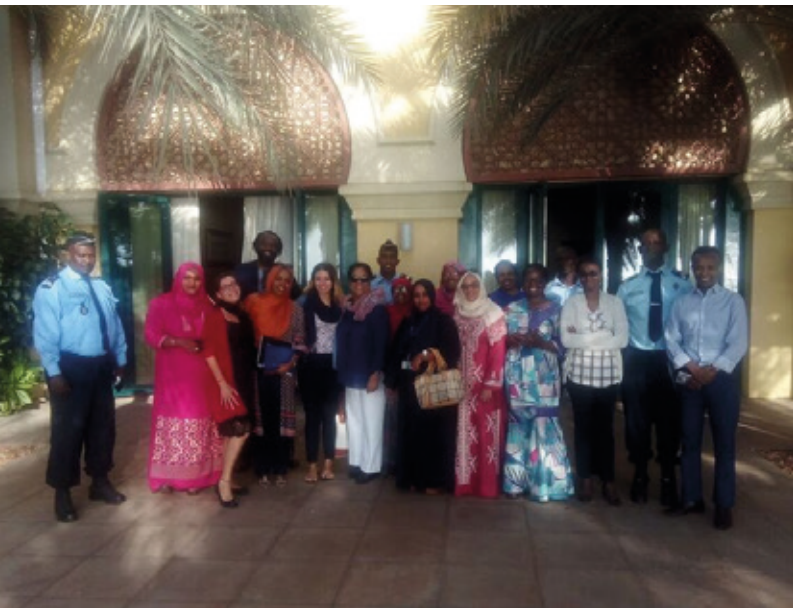
Workshop – Djibouti

remain silent, the right to legal representation, the right to stay in contact with their family, the right to freedom (except for extenuating circumstances) and the right to educational rather than repressive measures.