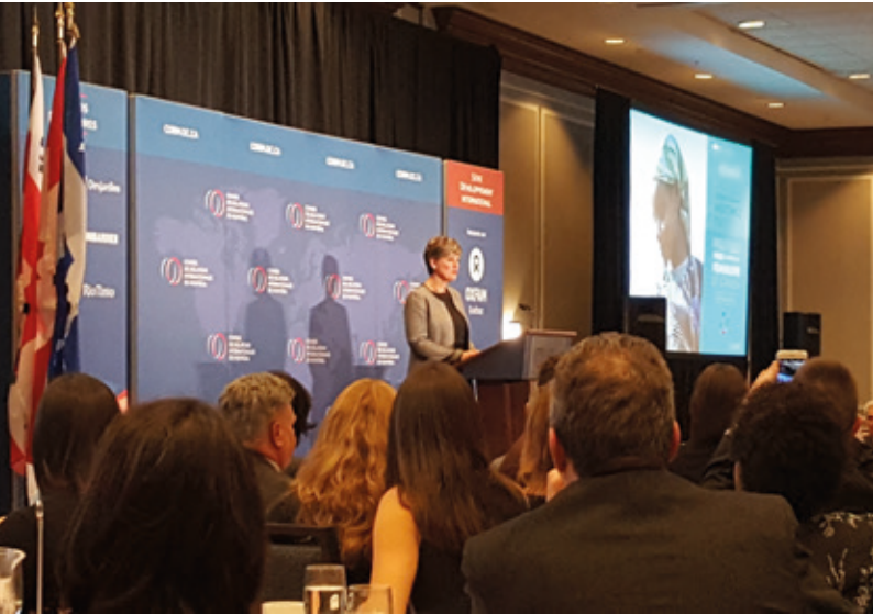
Luncheon for Canada's Feminist International Assistance Policy – Canada's Minister of International Development and La Francophonie, Marie-Claude Bibeau

All children have equal rights and our programmes aim to encourage participation and equality between girls and boys. Thus, we have developed and implemented specific strategies within our projects and interventions. After having taken part last year in a strategic consultation session with the Government of Canada to identify the best way to refocus Canada's international assistance, the IBCR was very pleased to attend the launching of Canada's new Feminist International Assistance Policy. Over the next five years, 15% of Canada's bilateral international development aid will be allocated to projects aimed at gender equality and at empowering women and girls. The IBCR is dedicated to supporting girls for the full respect of children's rights and we are overjoyed by the feminist consideration being given to Canada's international assistance policy.