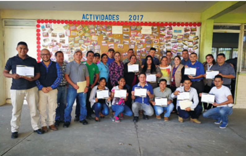
Certification of personnel – National Institute for Juvenile Offenders (INAMI)

To better manage detention centres in Honduras (“centros pedagógicos”), the State created a government institution called the National Institute for Juvenile Offenders (INAMI). In cooperation with DINAF, the IBCR organised and facilitated four days of awareness training on incarcerated children's rights for personnel from the country's central region's detention centres. Thanks to these workshops, more than 200 participants were trained on children's rights . Those in attendance included: • Security personnel • Support and administration staff • Psychologists, social sector personnel, legal advisors and medical staff