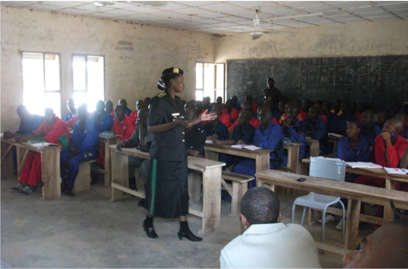
Training of municipal police officers – Maradi, Niger

• Despite the positive commitment of stakeholders, and the integration of training into professional programmes, the durability of these projects cannot be ensured due to the lack of local resources. It was therefore important for the IBCR’s programme teams to focus on the best ways to increase the durability of post-project actions. Discussions have since been had, based on transfer strategies with local partners and organisations.