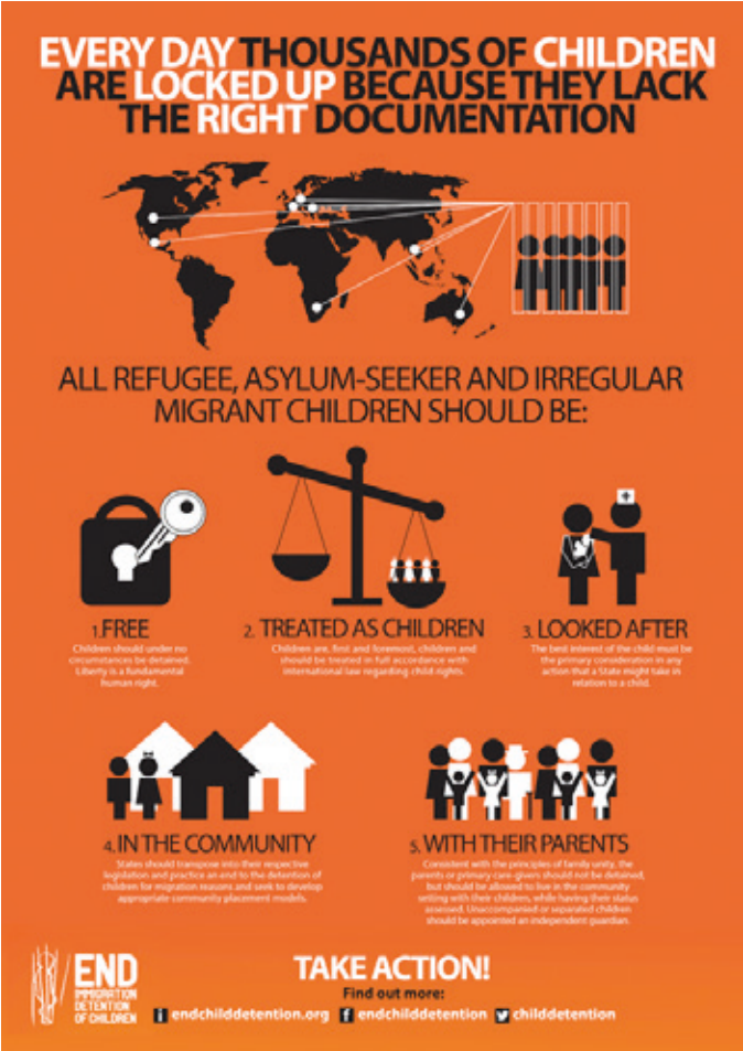
Campaign poster - End Child Detention

In 2017, the 5 th anniversary of the global campaign to “End immigration detention of children” took place. This campaign was started by the International Detention Coalition following the 19th session of the UN’s Human Rights Council in Geneva. As one of the signatories, the IBCR is proud to have participated, along with 130 organisations from around the world, in the digital platform media strategy launched by End Child Detention, which aimed to raise awareness and inform the general public of situations faced by children who are deprived of their freedom. Also in 2017, Global NextGen Index, a new project, was established to assess the progress made by 22 countries, including Canada, in the development of alternatives to immigrant detention. François Crépeau, an IBCR board member, now sits on the Canadian committee in charge of classifying countries and providing recommendations for the development of a national strategy.