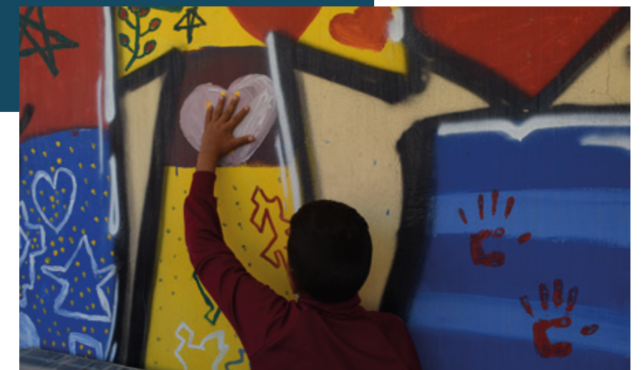
Child and mural at the Bayti Association