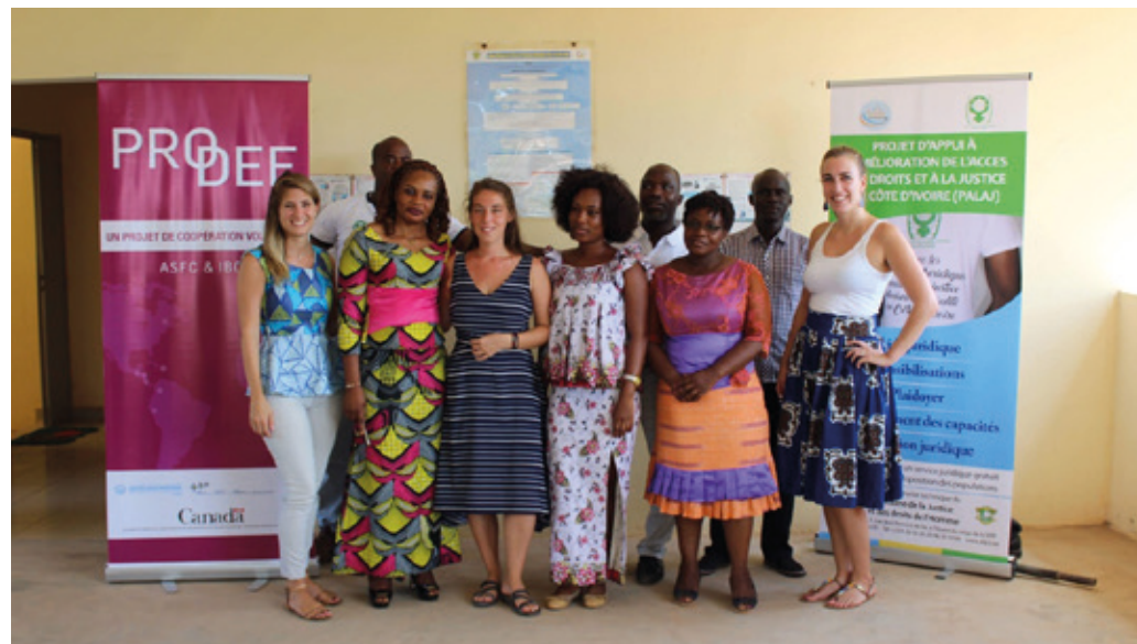
Volunteers - Côte d'Ivoire