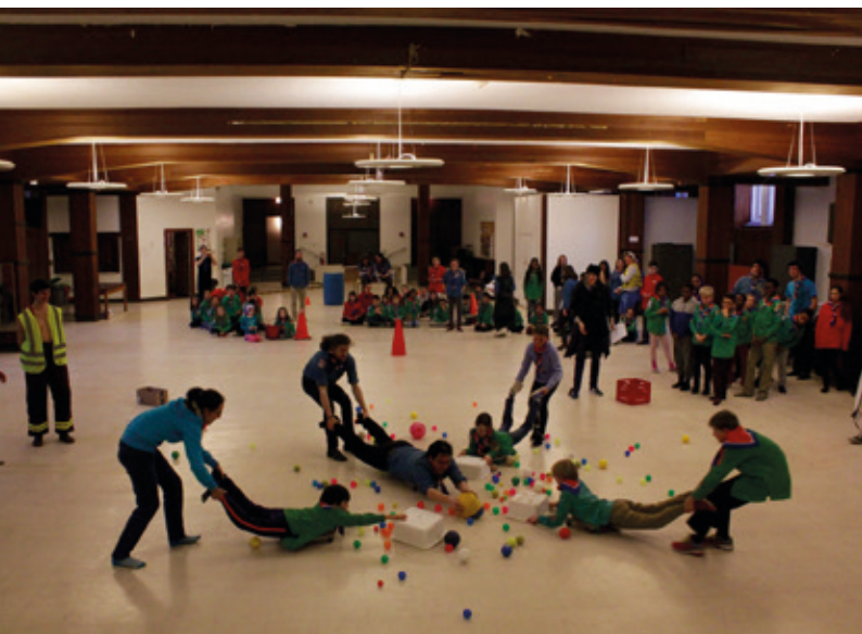
Scouts fundraising activity