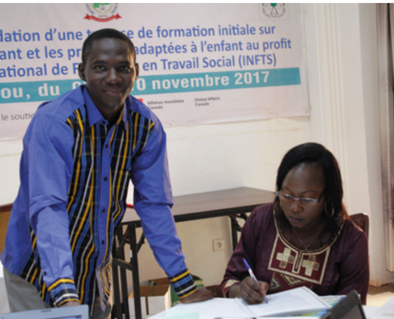
Validation workshop for a basic training kit, National Social Work Training Institute – Ouagadougou

This year, several activities were implemented: production and dissemination of a report on the situation of the child protection system in Burkina Faso, professional exchange trips between Togo, Benin, Tunisia and Senegal, validation by the various departments involved of training kits, development of advocacy and gender equality strategies. Some of our preliminary results include: