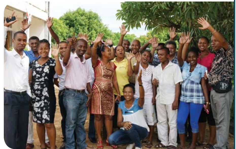
Study project on child exploitation — Madagascar — 2017

Significant: we work tirelessly to ensure that our interventions to strengthen the child protection system and our advocacy, are qualitatively significant and far reaching in the lives of children, and that they are meaningful for the people involved.