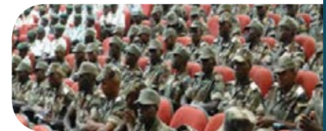
Training for defence and security forces – Niger – 2013

We work to protect and promote children's rights during emergency situations caused by crises, armed conflict or natural disasters, particularly those related to climate change. By strengthening the capacities of all humanitarian workers, we aim to effectively apply national, regional and international laws and standards related to sustainable knowledge and know-how.