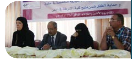
National police training – Yemen – 2014

We strive to protect child victims and witnesses of crime, as well as children who are in conflict with the law, by responding to requests for support expressed by governments, professionals, and the girls and boys who are directly in contact with the system. To ensure respect for the rights of children in contact with the criminal and civil justice systems, we ensure that the trajectory of boys and girls within the judiciary experience remains at the heart of this educational, participatory and multisector vision.