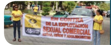
Campaign against sexual exploitation – Costa Rica – 2013

Along with our partners, we aim to prevent all forms of child exploitation, violence, abuse and neglect. This includes sexual exploitation (particularly in the travel and tourism industry), child pornography, urban or armed conflict, child trafficking, early or forced marriage, and all other practices that threaten child survival or development. We ensure that children are offered better protection and that those who face different forms of exploitation and violence are protected, listened to and respected.