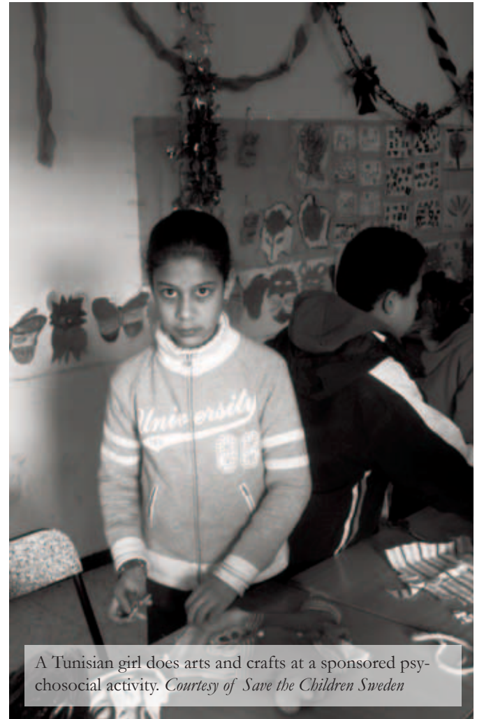
A Tunisian girl does arts and crafts at a sponsored psychosocial activity.

Child labour is closely linked to the rates of children who drop out of school. As mentioned earlier, it is estimated that between 60,000 and 80,000 children drop out of school each year, while 7.6% of children drop in their 7th year. Moreover, these children have no access to second-chance education or vocational training. They are often used as apprentices on the margins of formal training.