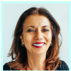
Najat Maalla M'jid

UN special representative of the Secretary-General on violence against children