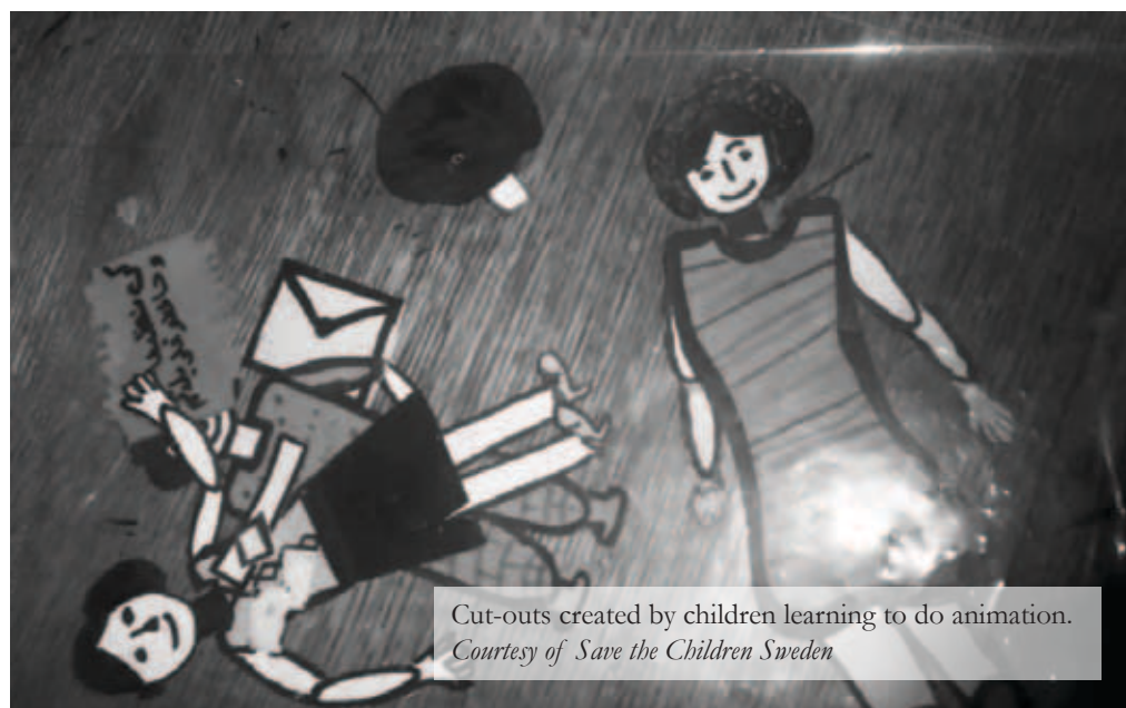
Cut-outs created by children learning to do animation.

As part of its efforts to improve the quality of education in Egyptian schools, the Government of Egypt has recently established a National Agency for Quality Assurance and Accreditation. UNICEF supports this programme through school improvement projects in two governorates in Upper Egypt, reaching 195 primary schools in order to