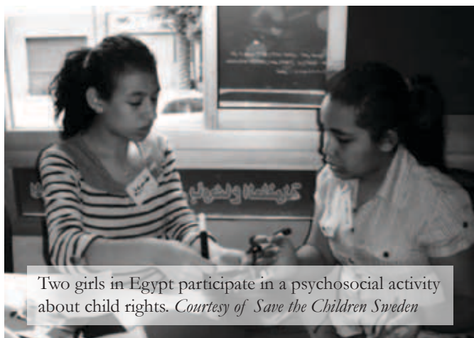
Two girls in Egypt participate in a psychosocial activity about child rights.

In June 2011, Human Rights Watch warned that Egypt's transition to democracy is at risk unless the military transition government carries out a number of human rights reforms, including lifting the state of emergency, ensuring the prosecution of security officials responsible for serious abuses, repealing laws that restrict free expression, association and assembly, and ending trial of civilians before military tribunals. 30