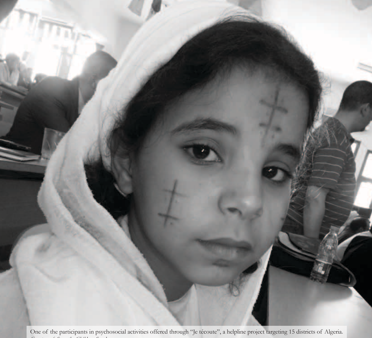
One of the participants in psychosocial activities offered through "Je técoute", a helpline project targeting 15 districts of Algeria.